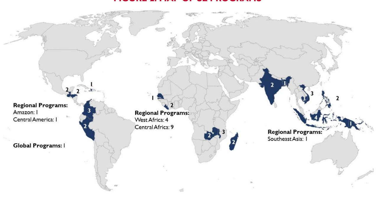
FIGURE 2. MAP OF SL PROGRAMS