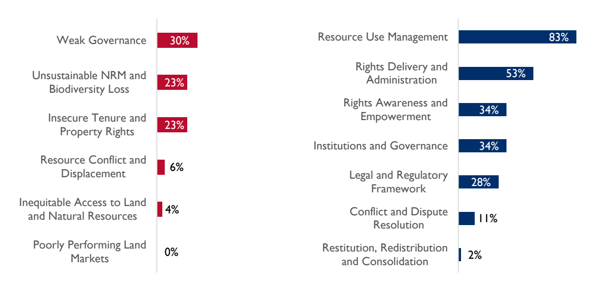
FIGURE 6. LRG INTERVENTIONS

The following section presents key takeaways from the analysis of the 53 SL programs, highlighting both common themes across interventions as well as gaps where additional attention to LRG issues might have improved program outcomes. The tables in the Annexes present detailed findings from the 53 programs examined on LRG interventions and constraints.