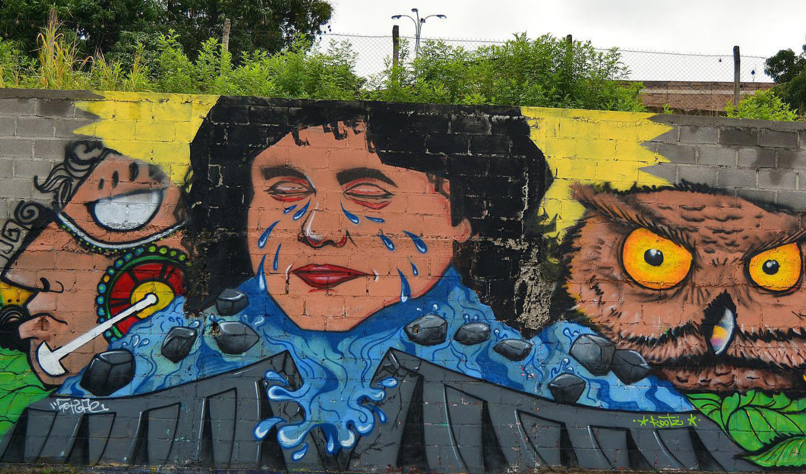
Mural of Berta Cáceres in Tegucigalpa, Honduras.