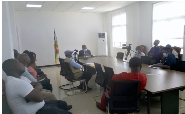
Photo 10: The Minister of Mines press conference on COVID 19.

In April 2020, AMPR organized a press conference for the Minister of Mines to launch the MMG COVID-19 Action Plan and seek coordinated support of key actors in implementing the proposed responses to mitigate the spread of the pandemic in the CAR mining zones. The press conference was broadcasted nationally in French and Sango by television, radio, and written press.