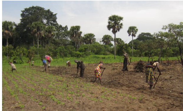
Photo 5: Camp-Ngoum Livelihoods group, in Boda, working in their garden.

The groups have started planting their gardens, which range from two to five hectares, as the rainy season begins, using their acquired farming best practices. AMPR provided the groups with gardening tools and AFPE coordinated with the Regional Directors of the Ministry of Agriculture and the United Nations (UN) Food and Agricultural Organization (FAO) to secure seeds to plant 60 hectares. To respect GoCAR COVID-19 guidelines, each group developed a working roster for not more than ten members working on rotation. Other income-generating activities like pisciculture and small-scale businesses did not start due to the COVID-19 restrictions.