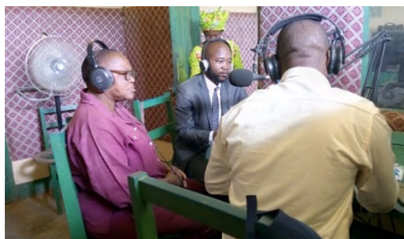
Photo 6: Nola Subprefecture and Regional Mining and Health Officers in Nola debating COVID-19 concerns on radio Kuli-Ndounga.