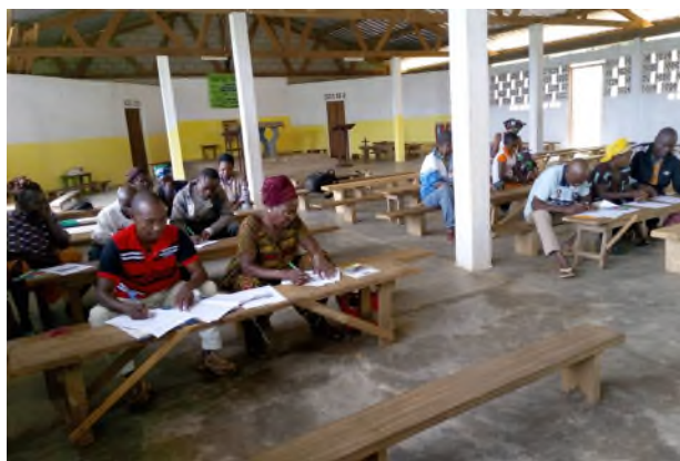
Photo 4: AFPE Technical Training for Members of Loppo group in Nola.

Results: AMPR subcontractor Action for the Promotion of Entrepreneurship (AFPE) continues to support 21 livelihoods groups in Carnot, Nola, and Boda to increase the social and economic inclusion of women in mining areas. AFPE is providing women's and mixed-gender groups training in agricultural techniques, basic marketing and value-added strategies for their products, group savings and credit practices, and management strengthening, as well as encouraging their entrepreneurial spirit. AFPE completed training for the 451 members of the 21 groups on sustainable farming, garden site selection, garden preparation, sowing, crop protection techniques, harvesting, and conservation techniques.