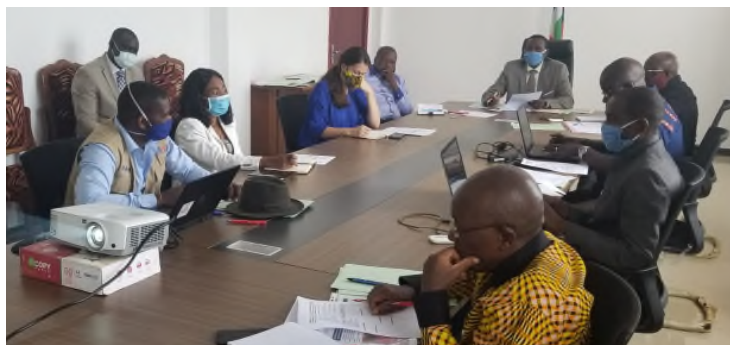
Photo 8: Representatives of AMPR, MINUSCA, PGRN, GODICA, CNSPK, KPPS and MMG reviewing the reporting template for the KP priority zones.

Partners: The AMPR COP participated in several planning meetings with representatives of MINUSCA, PGRN, GODICA, CNSPK, KPPS, and MMG to strengthen KPPS coordination. This quarter the group reviewed reporting templates, CLS quarterly reports, and MMG policy documents. By increasing understanding of planned activities for the various projects supporting the Ministry, the meetings resulted in enhanced information sharing and coordination of MMG partners.