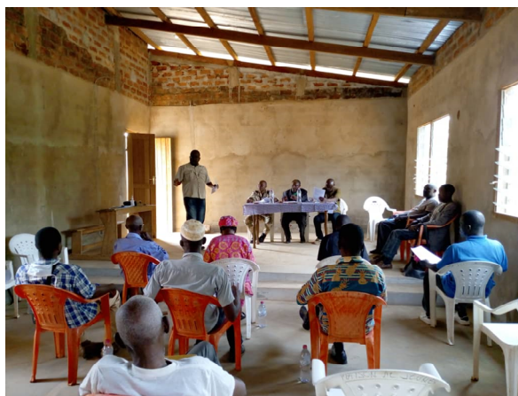
Photo 2: Sous-Prefect of M'Baïki chairing the CLS meeting in M'Baïki.

Description: This activity aims to support the KPPS in close collaboration with other donors. Building upon recommendations formulated under PRADD II, AMPR will support the KPPS in identifying sustainable avenues for the KPPS Focal Points. AMPR will cover the per diem costs for no more than 14 Focal Points in Year I and defray some motorcycle driver and rental costs. It is hoped that the World Bank will subsequently provide motorcycles to the Focal Points. AMPR will not pay the fuel costs associated with the motorcycles. A memorandum of understanding (MOU) spelling out the respective donor and KPPS Focal Point support will outline these arrangements. In addition, this MOU will detail the other anticipated functions of the Focal Points and AMPR support related to data collection and management, such as trainings on data analysis.