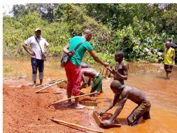
Photo 1: Interviews with the artisanal miners in Carnot Sous-Prefect.

Nagbata Magazine Radio Programs: AMPR subcontractor Network of Journalists for Human Rights (RJDH), in coordination with the MMG technical team, developed content for radio programs to be aired as part of the popular Nagbata Magazine. Each segment is 30-minutes in length and centers on a specific theme related to the KP and artisanal diamond or gold mining. The sketches for the content were reviewed and approved by both AMPR and MMG technical teams. RJDH conducted field missions to start production and audio recording of the relevant actors. Up to 20 radio emissions are planned to be completed by the end of the next quarter. RJDH developed agreements with the community radios in Nola, Berberati, and Bayanga to support broadcasting of Nagbata Magazine radio shows.