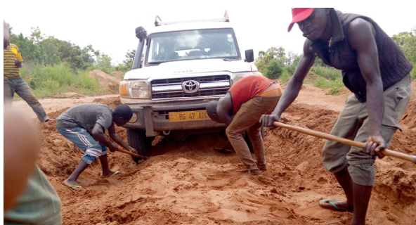
Photo 9: Community members rescuing a vehicle transporting AMPR field staff along Boda-Nola road