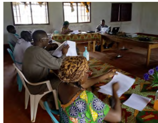
Photo 3: MHANR and AMPR workshop to validate CLPR study.

Description: This activity will build continuity with PRADD II, under which six CLPRs were established in Berberati, albeit with limited available time to support their work. To learn from the PRADD II experience and prepare for an expansion of committees and a strengthening of their capacity, the first activity of this component will be a joint MMG-Ministry of Humanitarian Action and National Reconciliation (MHANR) evaluation of the committees. In particular, this evaluation will examine the committees' actions and how they are perceived in their communities. To improve linkages with the KP Operational Framework, the same diagnostic will include an examination of the CLS and Antenne Locale de Suivi (ALS) committees established in compliant zones at the sub-prefecture and commune levels. The results of the diagnostic will be presented at a national workshop, during which time next steps will be determined.