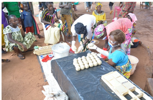
Photo 7: A soap-making Training of Trainers (TOT) for Bossoui group, Boda.