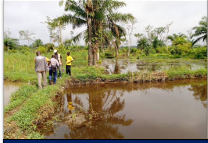
ENABEL Pisciculture Expert and USAID AMPR team assessing active fishponds in Nola.

Through focus group discussions and interviews with fishpond owners, the expert documented the technical and commercial characteristics that enabled many fish farmers to continue their activities from 2010 until today, as well as the factors that prevented others from pursuing this activity.