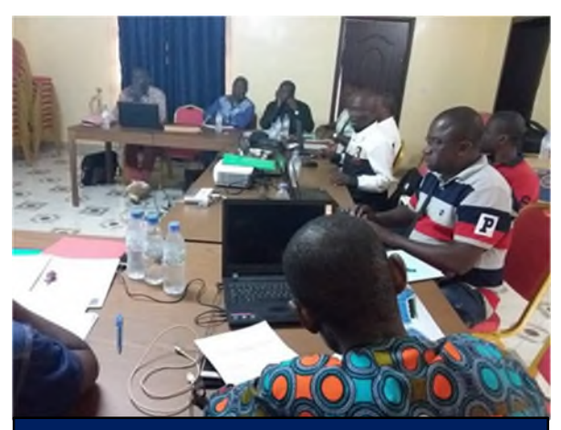
Photo 1: Working session of team at the Boali retreat.

committee is led by a National Coordinator from civil society, a professor from the University of Bangui, who will work with two nominated rapporteurs. The restructuring of the CAR KP National Monitoring Committee paved the way for USAID AMPR to engage them in discussions about areas of collaborations as per the AMPR Year 2 Work Plan. In December 2019 the project team participated in a three-day CNS PK retreat, financially supported by EU GODICA. Retreat participants discussed the compliant zones monitoring plan and analysis of the situation in the proposed KP priority zones, validated the CLS meeting agenda and reporting tools drafted by USAID AMPR, and drafted the 2020 action plan for the CNS PK. Next guarter, USAID AMPR will ensure that the action plan is consistent with the