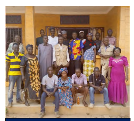
Photo 3: USAID AMPR Carnot team and the Carnot Centre CLPR members trained by the consultant.

USAID AMPR's local video subcontractor Société Elie Numérique worked with the lvoirian consultant to document the above training that will form part of the content of the five short videos