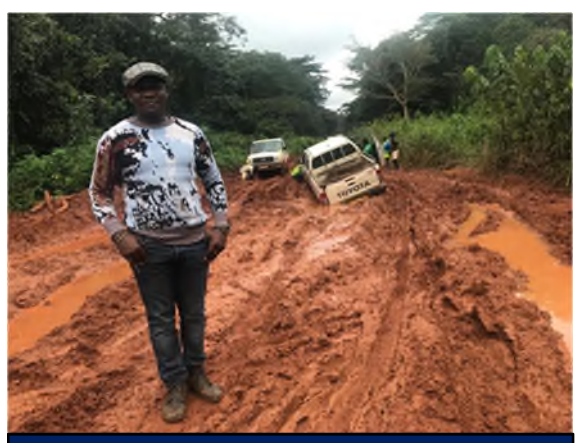
Photo 7: Berberati-Nola road impassable during the rainy season.

In early December, thieves stole the window glass for the USAID AMPR notice board that was fixed on the outside wall. The night duty guards did not detect the incident until the morning. The project's Bangui administrative held a meeting with BCAGS, the security service provider, who admitted the negligence of their night guards. Effectively, BCAGS changed the night guards and intensified night patrols around the office premises.