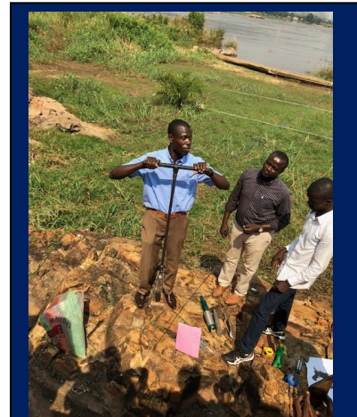
Figure 2: Demonstration of auger at Launch Event.

Results: No advancements this quarter except for the purchase and importation of two hand-held augers which will be used to train artisanal miners in more efficient prospecting but also environmental rehabilitation. The augers were demonstrated at the Launch Events.