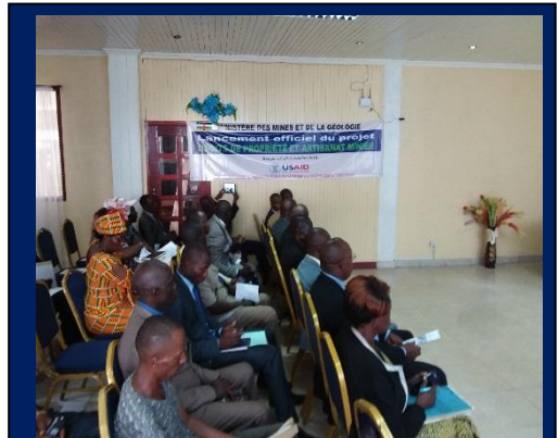
Figure 1: Launch Event for USAID AMPR project in Bangui, Central African Republic.

The project commenced with an Inception Phase focused on various launch events and work planning activities. This consisted of initial meetings in early October in Washington DC with the CO and the COR. The project start-up activities this quarter were focused primarily around preparing the Work Plan for October 1, 2018 – September 30, 2019 (hereafter Year 1 Work Plan). Following project launching activities with USAID in Washington DC in mid-October 2018, the project hired its core technical staff as short-term consultants. These staff members were primarily those from PRADD II in the Central African Republic. Temporary offices were loaned out by the Kimberley Process Permanent Secretariat for the first two months until new office space was located and a lease agreement signed.