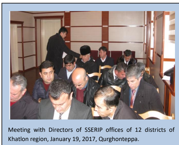
Meeting with Directors of SSERIP offices of 12 districts of Khatlon region, January 19, 2017, Qurghonteppa.