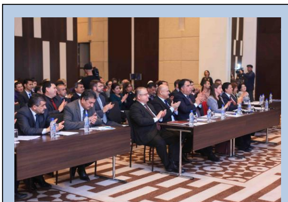
The Feed the Future Tajikistan Land Market Development Activity launch event, February 7, 2017, Dushanbe

market-based principles for agriculture land use transactions; c) simplifying land registration procedures; and d) increasing the knowledge and protection of farmers.