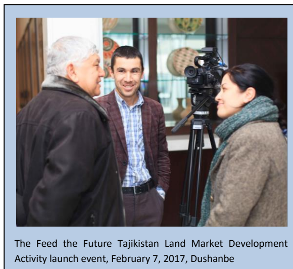
The Feed the Future Tajikistan Land Market Development Activity launch event, February 7, 2017, Dushanbe

On February 15, 2017, the Regional Newspaper of Khatlon, “Payk,” published an article critiquing the launch of the Feed the Future Tajikistan Land Market Development Activity, with the misunderstanding that the project facilitates U.S. land sales in Tajikistan. The project contacted the journalist and clarified the terms of buying, selling, and mortgaging land use rights according to the project’s objectives, and resolved the misconception.