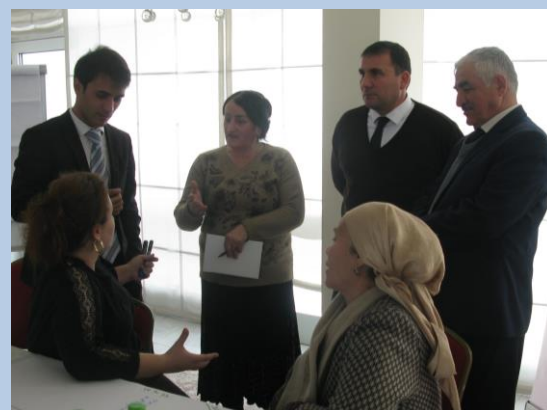
Round table with representatives from various NGOs, commercial law firms, and attorneys, February 24, 2017, Dushanbe.

To support the effective implementation of land use rights market and to ensure that farmers engaged in that market are protected, sustainable approaches to ensuring the provision of legal aid and dissemination of information and advice is critical. To achieve increased knowledge and protections throughout the ZOI, the project will explore and implement new models of legal aid that work within the framework of new legislative requirements (such as ensuring that only attorneys who are part of the Council of Attorneys provide fee-based legal services), disseminate information to farmers, conduct trainings for beneficiaries and stakeholders, and ensure that beneficiaries are able to access legal support throughout project implementation. During the reporting period, LMDA developed the new Strategy for Legal Aid and Informational Support to Farmers, which stipulates that the tashabbuskors network will provide informational consultation to farmers; legal aid will be provided by active organizations called “legal consultation”; and training will be conducted by NGOs. All these activities will be implemented through grant support.