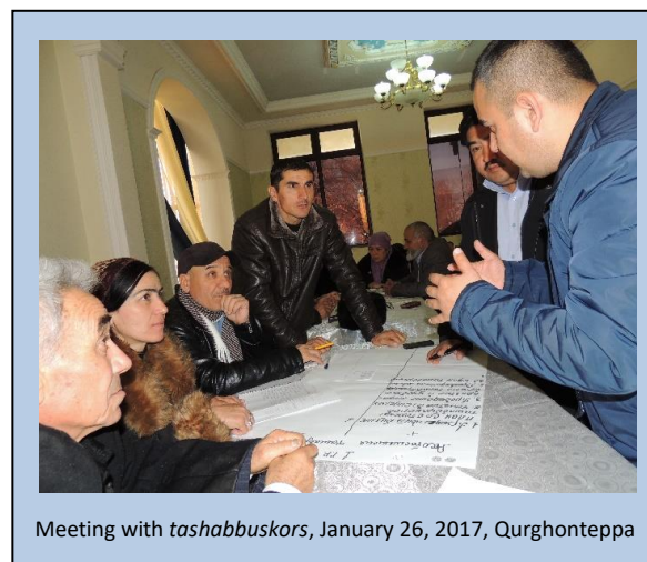
Meeting with tashabbuskors , January 26, 2017, Qurghonteppa

From March 27 to 31, 2017, the project assisted Mr. Bobomurodov with conducting informational visits to jamoats in 12 districts of Khatlon region. The Feed the Future Tajikistan Land Market Development Activity will continue supporting tashabbuskors to operate in all 67 jamoats of the ZOI through grants to be issued in April 2017, as well as through trainings on institutional development and land market development issues.