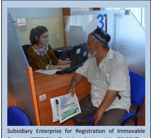
Property (SSERIP) in Shahritus districts, May 26, 2017

Between May and June 2017, LMDA trained 90 staff in the SSERIP offices of A. Jomi, Shahritus, N. Khisrav, and Khuroson districts on simplification of registration procedures