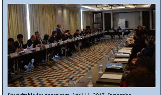
Roundtable for appraisers, April 11, 2017, Dushanbe

Once established, the Council on Appraising will create a system of state and public regulators of appraisal activities in the Republic of Tajikistan to ensure a competitive environment in the appraisal field and expeditious settlement of existing problems.