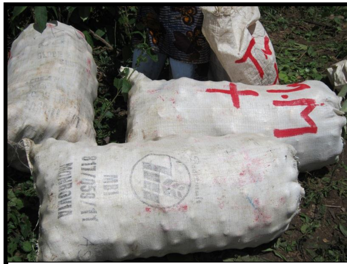
Harvested Cabbage and Egg plant for sale at Doumpa