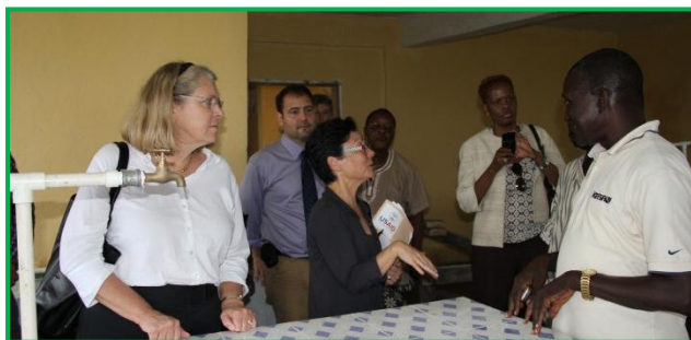
Visiting team tours newly agriculture science lab.

A delegation team from the U.S. State Department, including XXX , led by staff from the USAID Food and Enterprise Development (FED) Program, visited several FED project sites in Montserrado and Margibi counties on Wednesday, August 22, 2012. The overall purpose of the visit was to support FED's goal to build human resource capacity through creating centers of excellence.