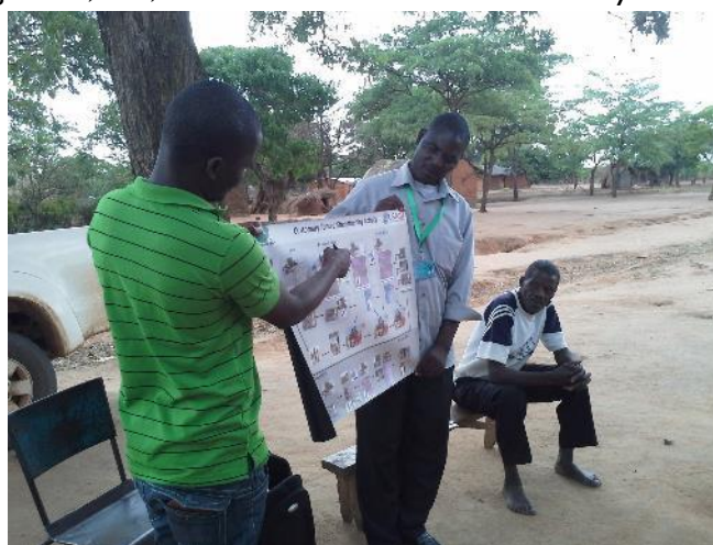
CDLA staff have started to begin customary land documentation in control villages from the impact evaluation. This will allow chiefs to have full chiefdom cadasters for use in their long-term planning.

implemented a two-phased approach in 134 villages, initially focusing on documentation of community resources and land governance rules, followed by documentation of household land holdings, culminating in the delivery of customary land certificates. In this quarter, CDLA continued to finalize signing and distribution of certificates from two participating chiefs, and began to complete demarcation and claims processes in Mkanda and Maguya Chiefdoms following the completion of the impact evaluation data collection in those chiefdoms. CDLA also continued to work with village land committees on administration and reporting, including a revision of the DHIS2 reporting system. At the end of the quarter, the CDLA suffered a deep tragedy with the unexpected death of Coordinator Noreen Miti on 17 December 2017. Program Coordinator Adam Ngoma is filling in for Ms. Miti moving forward.