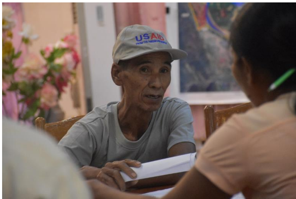
A participant at the LTP lessons learned workshop in Kalay

With the close of technical activities this quarter, many of LTP’s educational materials, both written and non-written, had wide distribution at the project’s lessons learned events. Over the quarter, LTP finalized several written materials which contribute to improved understanding of land governance in Burma. Newly submitted deliverables include a master PowerPoint presentation on land governance in Burma;