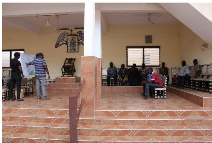
Explaining the Nyame Nyae community map to elders at Asankragwa Palace

The primary challenge faced was time pressure at the end to complete all activities before the pilot concluded. Engagement with government was also a challenge at the final workshop, as Ghana’s Cocoa Board was not actively engaged in the activity and did not participate in the final Accra workshop. It is