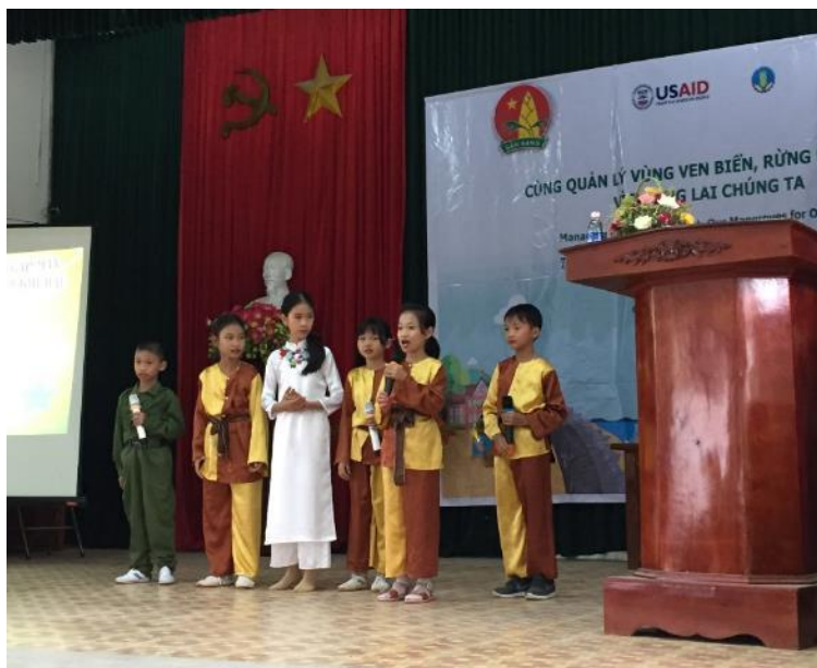
Schoolchildren performing a play about mangrove protection at a TGCC outreach event

Two gender briefs were completed and printed for dissemination. A blog on women and mangrove protection was published on ClimateLinks (see link in Annex C). The VFD Monitoring and Evaluation Specialist worked with the TGCC Vietnam team to draft a lessons learned report and brief; the brief was finalized for sharing, while the report will be finalized early in the next quarter. Additionally, local consultants and the TGCC team worked on the participatory coastal spatial planning toolkit guides, which were being designed and finalized at the end of the quarter.