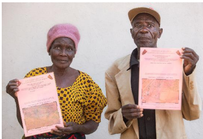
Community members in Langa Village, Mkanda Chiefdom participate in interviews on the impacts of customary land documentation on their agricultural decisions.