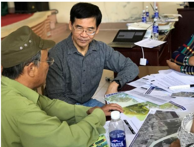
Participants discussing mangrove co-management at the community meeting in Dong Hung

Local consultants finalized a Coastal Spatial Planning report of Tien Lang district level after a technical workshop at the district level with participation of 38 relevant representatives from the District Peoples Committee, the Department of Agriculture and Rural Development (DARD), Department of Natural Resources and Environment (DONRE), Women's Union (WU), and other relevant organizations in October. Tien Lang District Peoples Committee, with support from