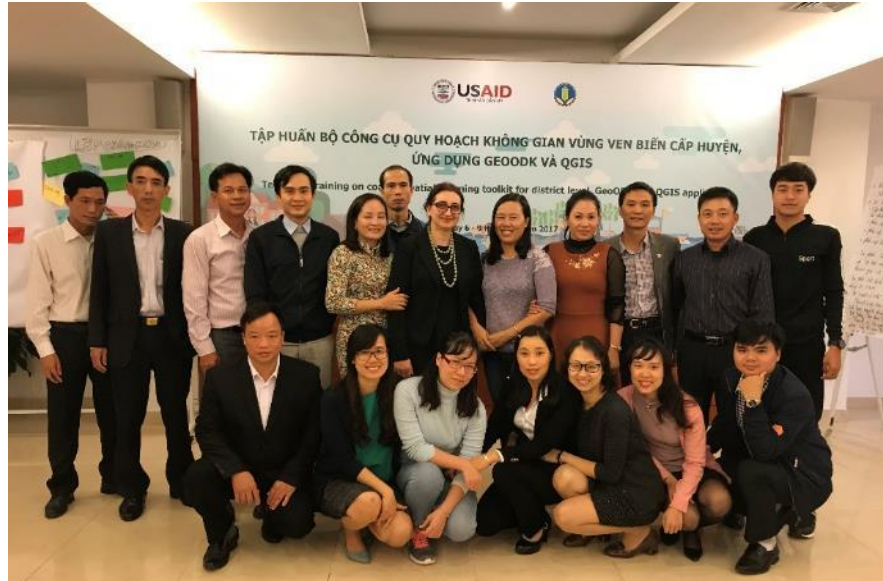
Participants at the participatory coastal spatial planning and spatial mapping tool training

that the conference was a good opportunity to review the three-year implementation of Decision 120 for protection and development of coast forests to clarify what has been achieved and what has not and to discuss the challenges and solutions to overcome them, and urged coastal provinces to revise their coastal forests master plans by using spatial planning and multi-sector integrated planning approaches.