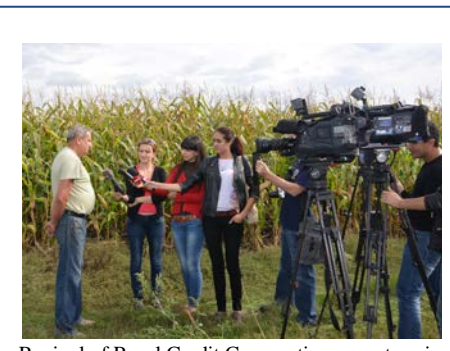
Revival of Rural Credit Cooperation press tour in Cherkasy oblast, September 10.

On September 10, 2013, a press tour entitled "Revival of Rural Credit Cooperation" was conducted as part of the My Land - My Right public education campaign which is being implemented by the Ukrainian Education Reform Center with USAID AgroInvest Project's assistance. The press tour familiarized journalists with the activities of Credit Union "Kreditsoyuz", partner of USAID AgroInvest Project, with a focus on its financial services and interaction with small and medium agricultural producers. The trip to Cherkassy oblast started with a