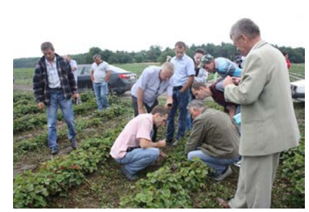
Demonstration site visits on growing and marketing of strawberries and raspberries, Ternopil oblast, August 14-15, 2013

expose small and medium-sized agriculture producers – members of credit unions Kredyt-Soyuz, Boikivshchyna, Slobozhanska, Kredyt-Fos, Narodna Dovira, Diya, Samopomich, Dovira and Yednannia – to cutting-edge technologies for strawberry and raspberry growing and distribution as well as to help them obtain loans for strawberry and raspberry field development. Representatives of agricultural