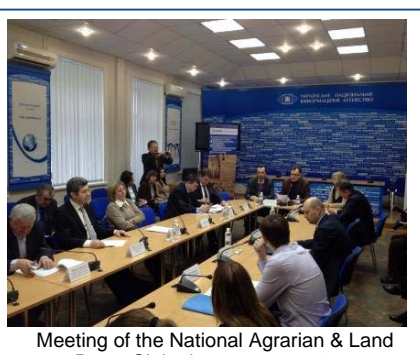
Press Club, January 23, 2015

Of special note was the January 23, 2015 round table, entitled "How Do the Government and the Agricultural Community See the New Regulatory Policy on Agriculture and How Successful Will It Be?" The round table was attended by Deputy Minister of Agrarian Policy and Food Volodymyr Lapa and other top officials, as well as leaders of industry associations and leading researchers. The event was instrumental in raising pressing issues of agricultural reform. These include decentralization, deregulation, and anti-corruption initiatives to be included in the Government Program.