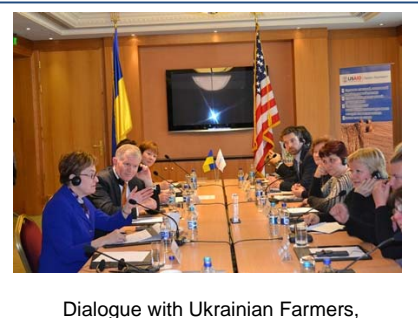
Dialogue with Ukrainian Farmers, March 11, 2015

"Improving Access to Seeds for Ukrainian Farmers" that was attended by members of credit unions and members of the United States House of Representatives. Congresswoman Marcy Kaptur (OH) and Congressman Pete Visclosky (IN) met with Ukrainian farmers and representatives of credit unions to discuss major inhibitors to growth and access to good quality seeds for small Ukrainian farmers, especially women farmers.