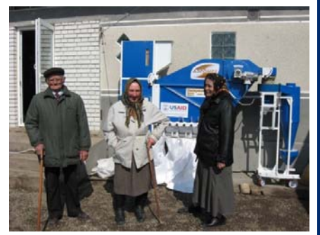
Three members of the Lypivsky cooperative with post-harvest processing equipment used to produce dried vegetables

Value-Added Borsch: Connecting Agricultural Cooperatives to New Markets