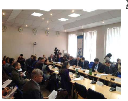
A round table organized by USAID AgroInvest to discuss ways to streamline regulations on crop rotation in Ukraine

Crop rotation is an important agricultural practice used to preserve the fertility of land. It is essential to establish sound and appropriate regulatory tools to achieve this aim.