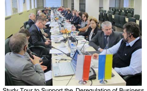
Study Tour to Support the Deregulation of Business Environment in the Agriculture Sector, Poland and Czech Republic, January 25-31, 2015

The project organized 43 public events in