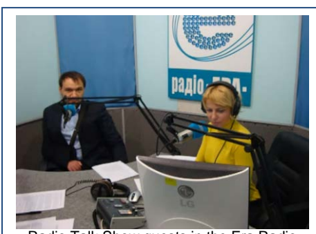
Radio Talk Show guests in the Era Radio Station, February 27, 2013

The National Agrarian & Land Press Club established as part of the Land Rights Public Education and Outreach Campaign conducted five events in the reporting period. In order to support the overall goals of AgroInvest, the subject matter of these events were