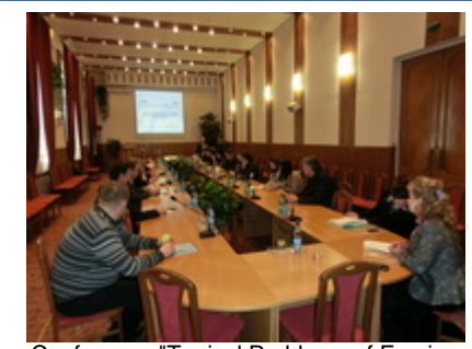
Conference "Topical Problems of Foreign Economic Relations of Ukraine with Other Countries in the Area of Trade in Agricultural Produce," February 28, 2013, Kyiv

On February 28, 2013, AgroInvest participated in the conference "Topical Problems of Foreign Economic Relations of Ukraine with Other Countries in the Area of Trade in Agricultural Produce." The conference was organized by the Agrarian Markets Development Institute (AMDI) under the USAID project "Financial Systems and Dialogue in Agricultural Policy." The event was attended by representatives of government, international financial organizations, banks, professional industry