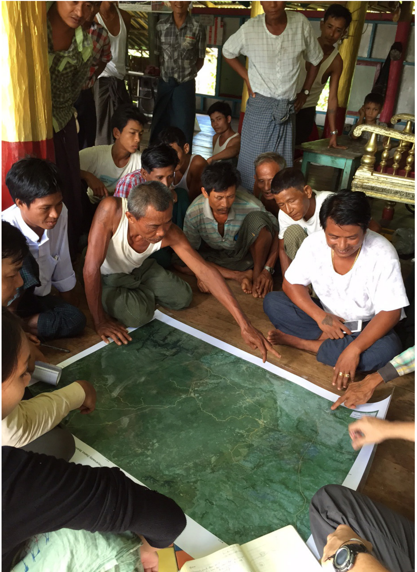
Villagers in Myanmar's Bago region consider for the first time an aerial photograph of their land area.