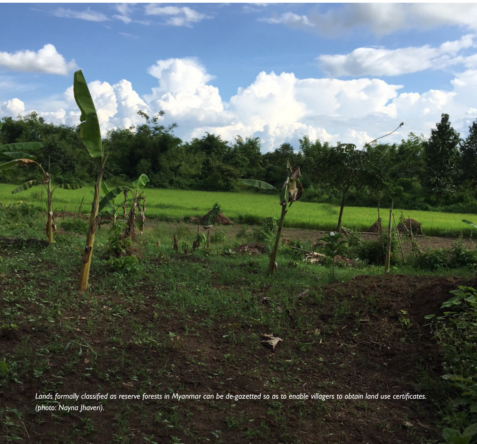
Lands formally classified as reserve forests in Myanmar can be de-gazetted so as to enable villagers to obtain land use certificates. (photo: Nayna Jhaveri).

implementation challenges. In Latin America, Brazil's resource conflict on indigenous lands provides insights into approaches for resolution. Colombia, with its ethnic diversity, illustrates how recognizing the customary rights of indigenous and Afro-Colombian populations in post-conflict areas can be implemented. Mexico's ejido model also provides a well-studied and longstanding example of codified communal rights in the agrarian landscape.