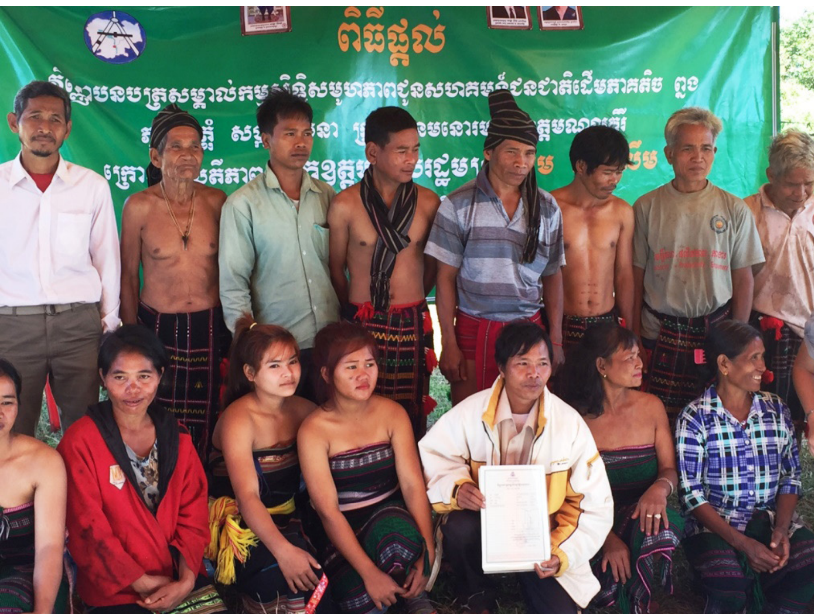
A community from the ethnic Bunong group in Mondulkiri Province receive their collective land title.

While IP communities may hold title to land once granted by the state, the land is still considered