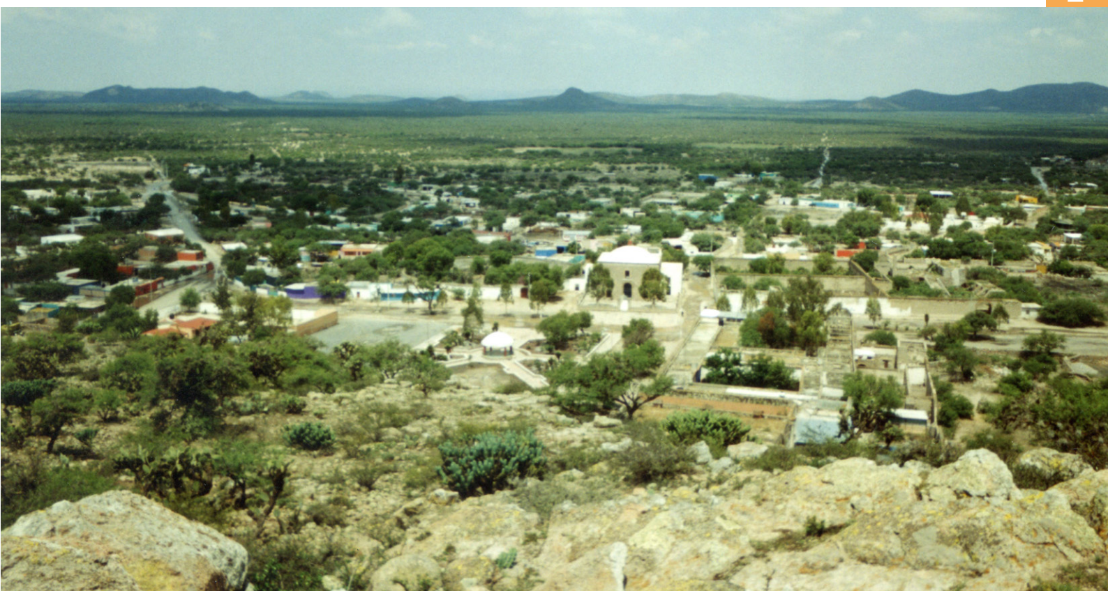
A view of a Mexican ejido in San Luis Potosi shows the large commons land in the background.

The land reform process granted land to communities of 20 or more members. Ejido land tenure typically comprises three jurisdictional land categories: communal lands (typically forests, pastures, and water resources), individual use parcels (for family farming and animal husbandry), and individual use urban housing lots known as solares . All ejidos (as well as indigenous lands) have the same governance structures composed of three bodies: