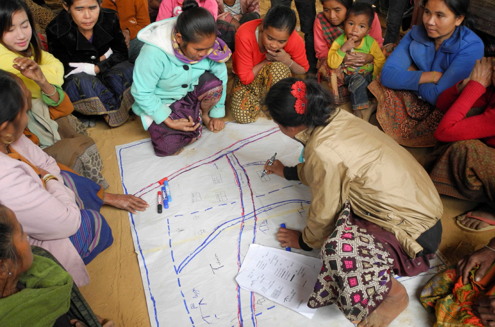
Local land governance in action in Lao PDR: Women develop a village map.