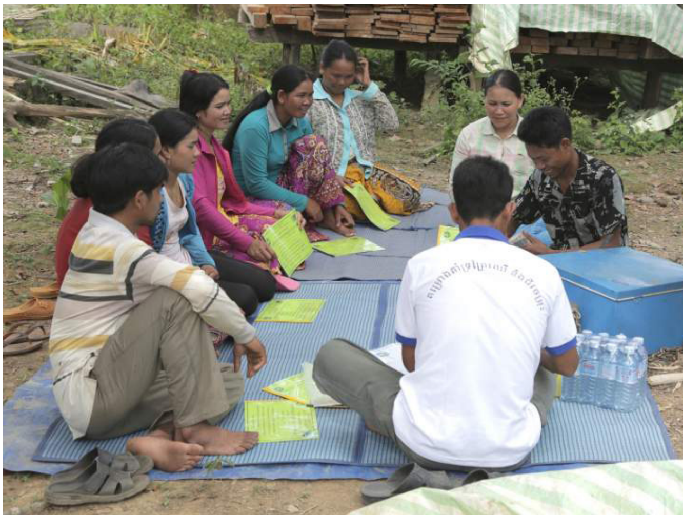
Indigenous people in Cambodia's O'Rona village discuss community land use planning and how to use and manage their resources sustainably.