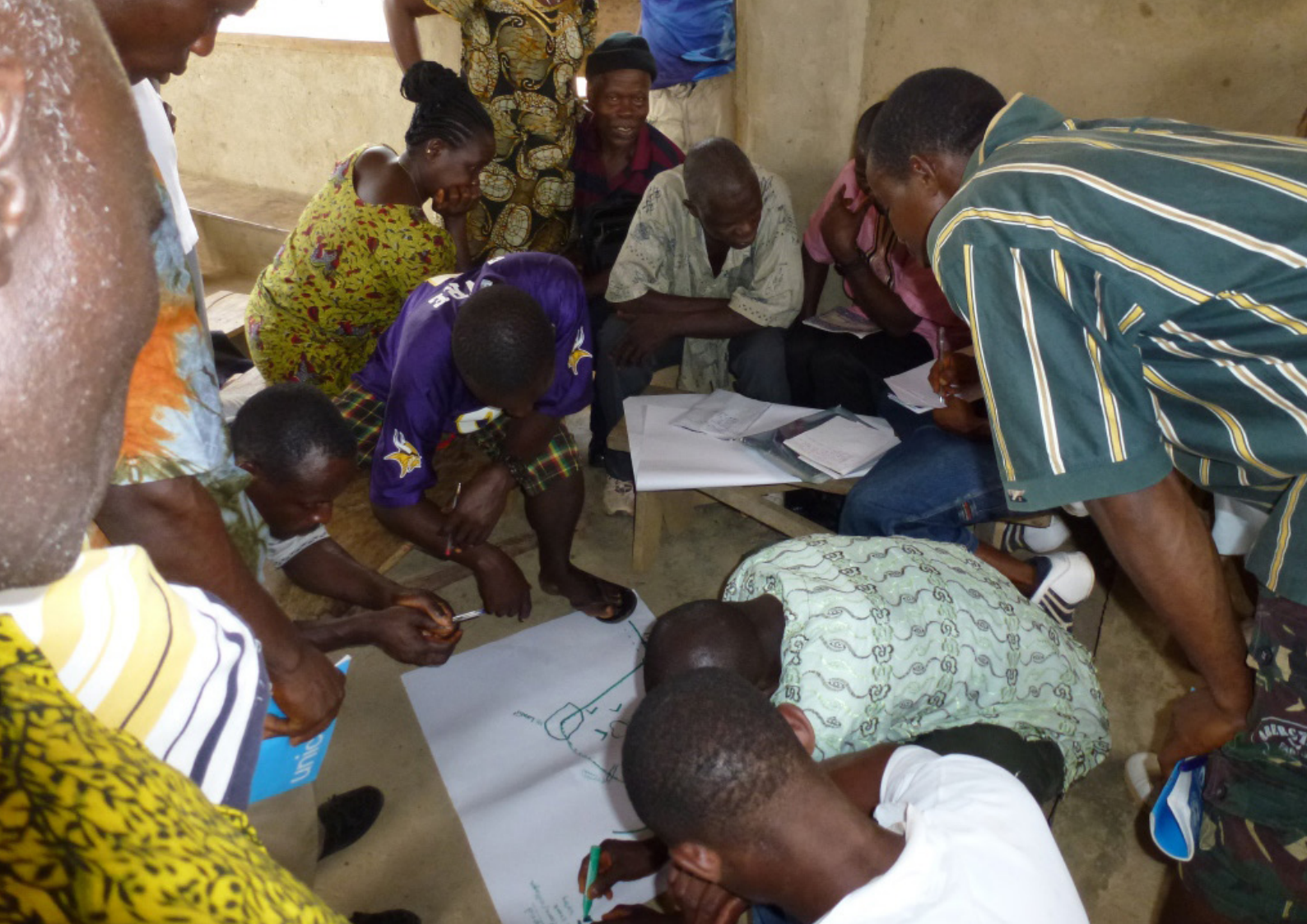
Community members contribute to the development of a preliminary map of village boundaries and resources as part of the process to recognize community rights to forestlands in Liberia.

to legal entities representing the community (LRP, §6.3.1), although the types of legal entities involved are not clear. As in Mozambique, it is proposed that management authority will rest in community representatives that must be selected in a way to ensure equitable representation of all community members (LRP, §6.4.1). Similarly, it is proposed that the community's representatives' decision-making be conducted in a way that ensures equitable representation and accountability to all community members (LRP, §6.4.1). The policy recognizes that this is an ambitious agenda and proposes that the government assist communities to self-define, obtain deeds, establish the community as a legal entity, demarcate boundaries, and put in place required governance and management procedures (LRP, §6.6.1). This will prove to be a challenge in a country with very limited resources.