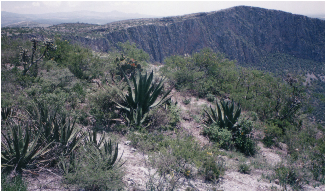
Ejidos can also include large areas which are remaining and not in current use.

In sum, ejidos have demonstrated that communal and individual land rights can effectively coexist within the same system while also successfully managing natural resources, particularly forests. Creating a special registry (RAN) for ejido lands, separate from the private land registry, and making its transactions free of charge ensured an effective “pro-poor” land reform process. Increasing access (through Internet and mobile transactions) to registry services will further incentivize investment in rural Mexican ejido lands. Additional effort is needed to ensure gender and intergenerational equity in conveying ejido property rights, to improve both the land registration and title systems, as well as community-level awareness of land rights (USAID, 2011c).