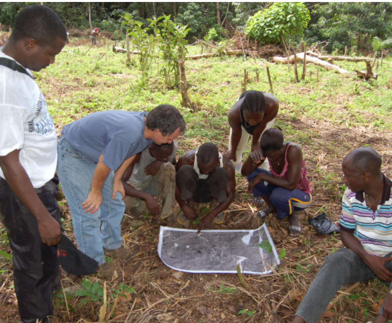
Community land mapping in Sierra Leone.

Finally, the case studies point to principles that can help guide policymakers. These include: