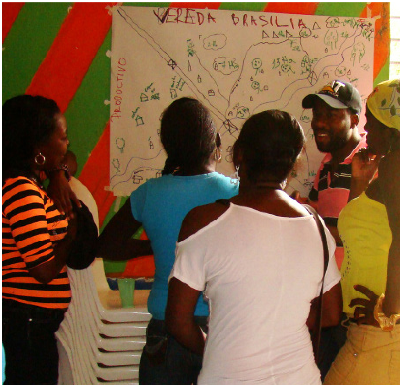
Afro-Colombian community land mapping.

been displaced by the conflict disproportionately more than any other groups. About 10.6 percent of Colombia's population are Black ("Afro-Colombian," primarily descended from the colonial African slave population), and 3.4 percent are Amerindian. From the 1960s until the early 2000s, the GOC attempted several land reform initiatives as a counter-insurgency policy for pacifying the rural conflict. Almost 40 years of state-led land reform have done little to affect overall land distribution; between the 1960s and 1990, the Gini coefficient 22 of the operational land distribution fell by only 3 percentage points, from 0.87 to 0.84 (Deininger, 1999). After several unsuccessful attempts at large-scale land reform in the early 2000s under Plan Colombia, the