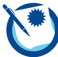
POLICY BEST PRACTICES

Burma's first National Land Use Policy (NLUP), which is largely based on international best practices such as the Voluntary Guidelines for the Responsible Governance of Tenure, was endorsed by Burma's government in January 2016, following three years of drafting and extensive, inclusive public consultations. USAID provided technical assistance and logistical support for communities and local CSOs to engage with the policy development process. USAID subsequently supported integration of the NLUP best practices into the Investment Law, Agricultural Policy, Agricultural Development Strategy, Community Forestry Instructions, and Livestock Policy as well as specific land laws, as opportunities arose.