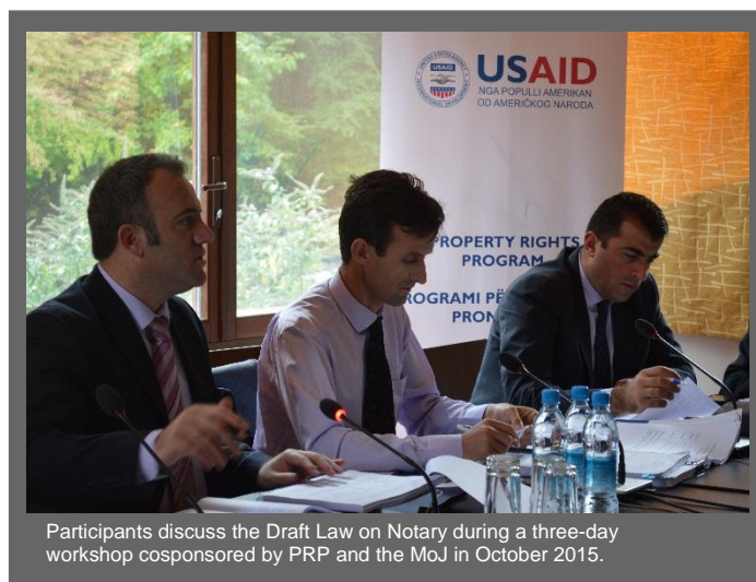
Participants discuss the Draft Law on Notary during a three-day workshop cosponsored by PRP and the MoJ in October 2015.

As requested by the MoJ, PRP funded and participated in a three-day working session to advance and all-but-finalize the draft Law on Notary. Participants included representatives from the MoJ, KJC, Kosovo Chamber of Advocates, Kosovo Chamber of Notaries, and the Swiss Coordination Office Twinning project, "Improving Approximation of Laws and Coherence of the Legal Framework." As with previous sessions, views were sharply divergent on the appropriate role and functions of notaries, with the Chamber arguing for greatly expanded powers and functions, and the two USAID projects sharing an opposing view. It has been decided that the Minister will make the final decision and alternative versions of the relevant articles will be prepared. The MoJ has moved the draft Law on Notary to the legislative calendar for 2016 and has committed to finalize the draft by June 2016.