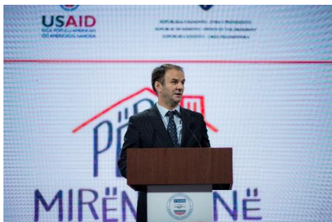
Kosovo Minister of Justice Hajredin Kuçi delivering remarks at the PSA Launch Event for the Për Të Mirën Tonë campaign, which is an initiative supported by the Office of the President and implemented by the USAID Property Rights Program.

Objective 4: Improved Communication, Access to Information and Understanding of Property Rights