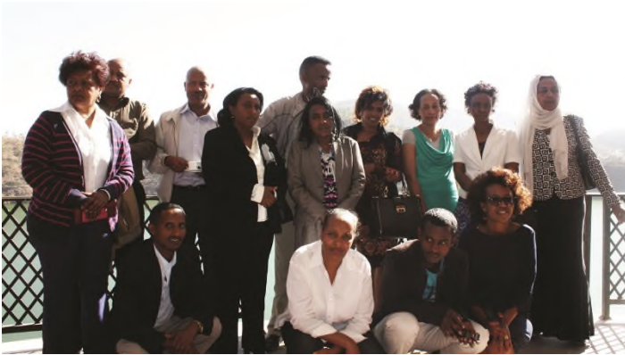
Women's land rights taskforce conducted its inception workshop from 5 to 6 February, 2015 in Bishoftu town. 19 participants from various government ministries and stakeholders attended the workshop