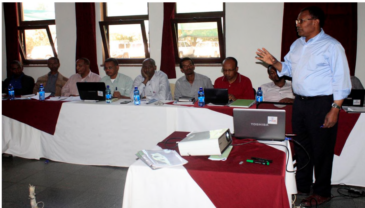
LAND and PRIME presented their recommendations on the level of grazing unit for certification and the governing body in a technical workshop that was held from 3- 4 January 2015 in Hawassa town

At the end of the workshop it was concluded that the rural land laws of Oromia regional state do not have adequate provisions for the administration and governance of pastoral land use rights and hence drafting a new regulation would be appropriate. On the other hand, the Oromia regional state was not convinced that