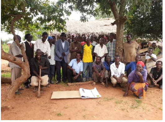
Community members in Kakota village celebrate the successful resolution of village boundary conflict.

For more information, contact: <u>USAID COR:</u> Stephen Brooks; <u>sbrooks@usaid.gov</u>