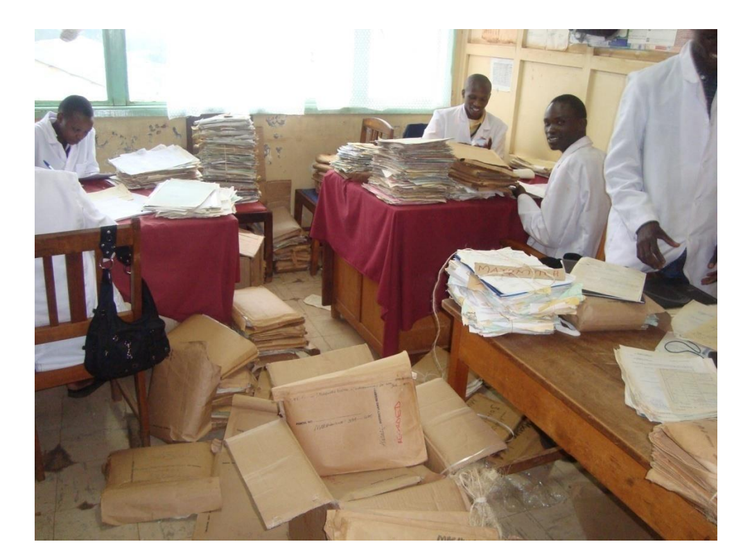
Interns sorting the documents and entering into ledgers