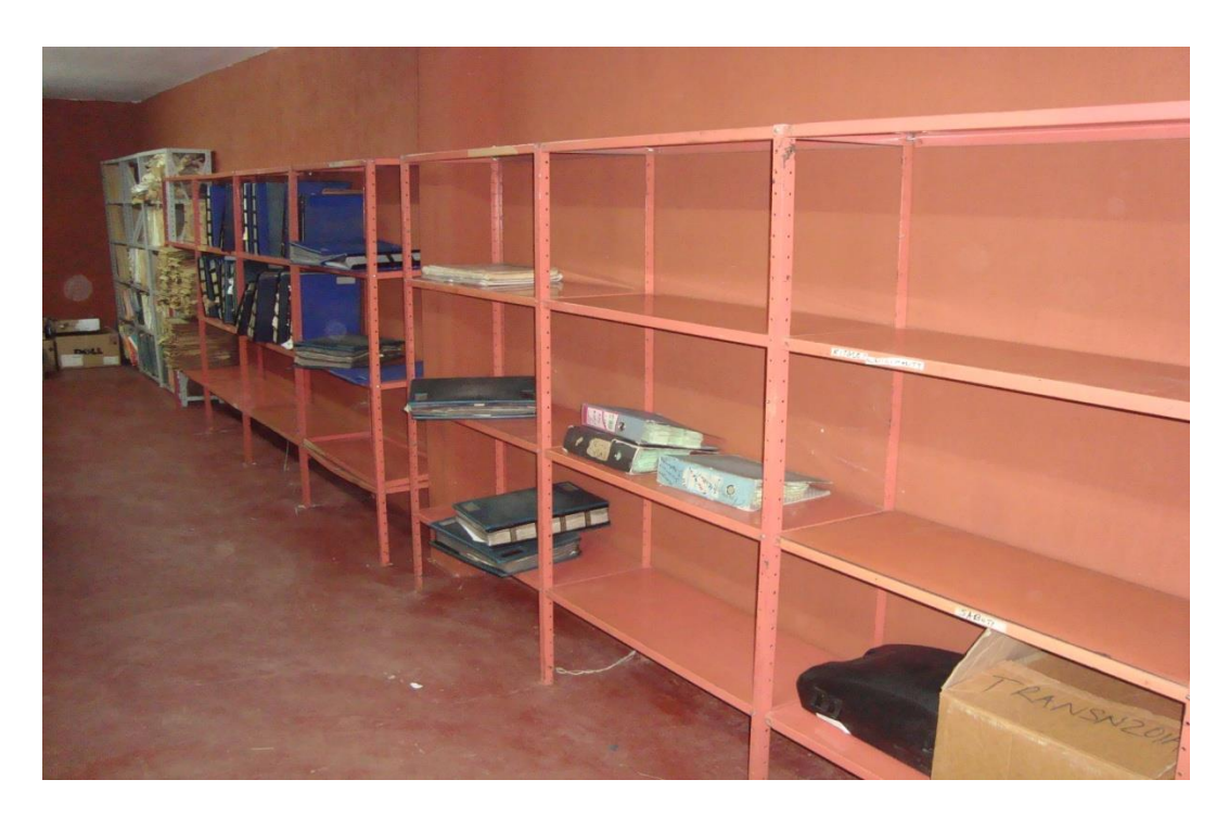
Additional Filing racks in the spacious archive