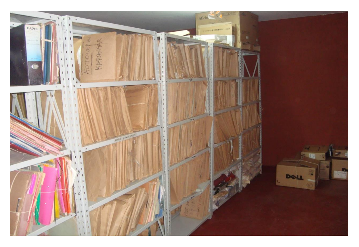
Sorted documents arranged in agreed format