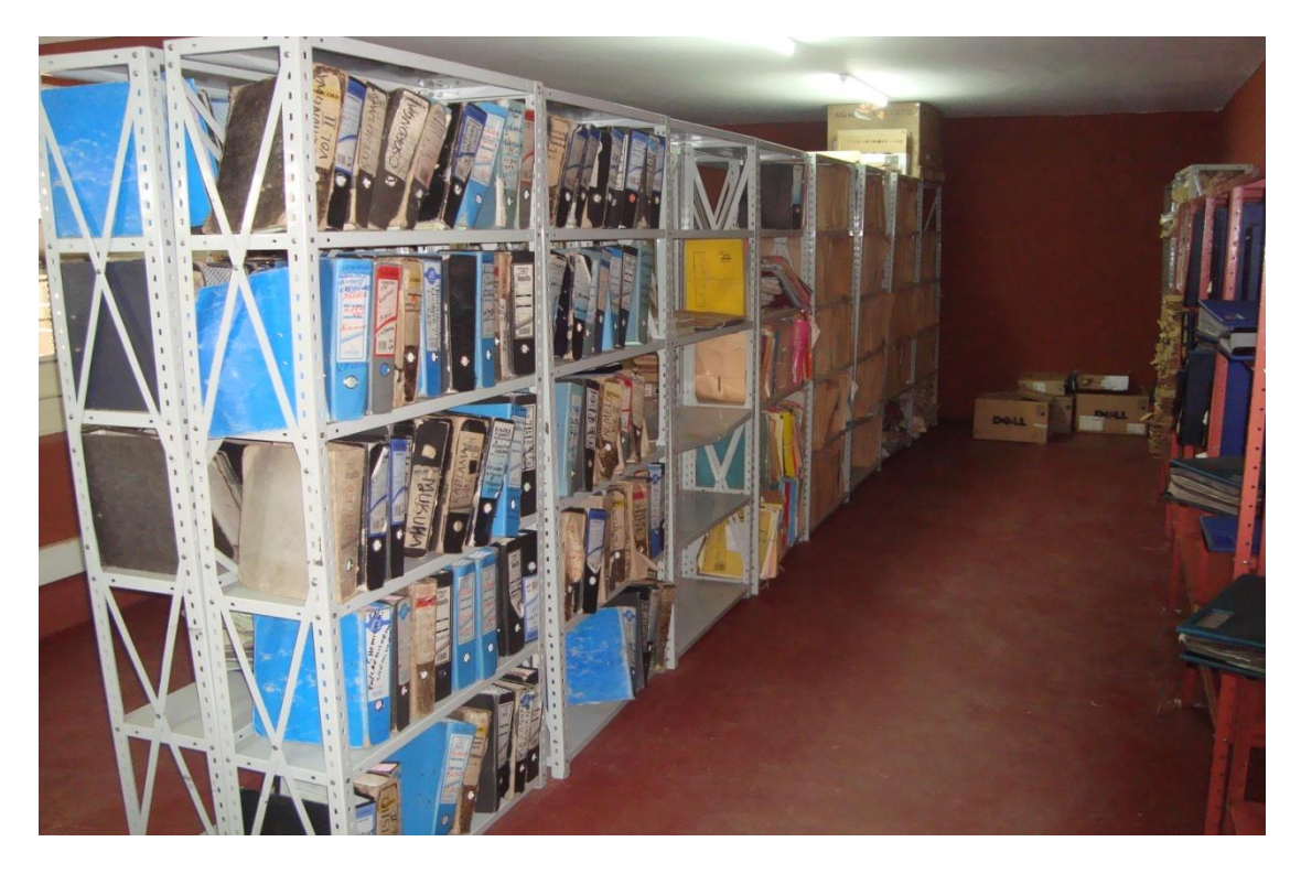
Land Registers properly arranged