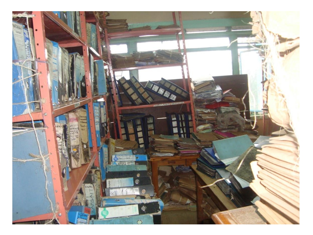
Land Registers and Files crammed in a small storage/Archive

Parcel files stored in no particular order- note land registers on table top