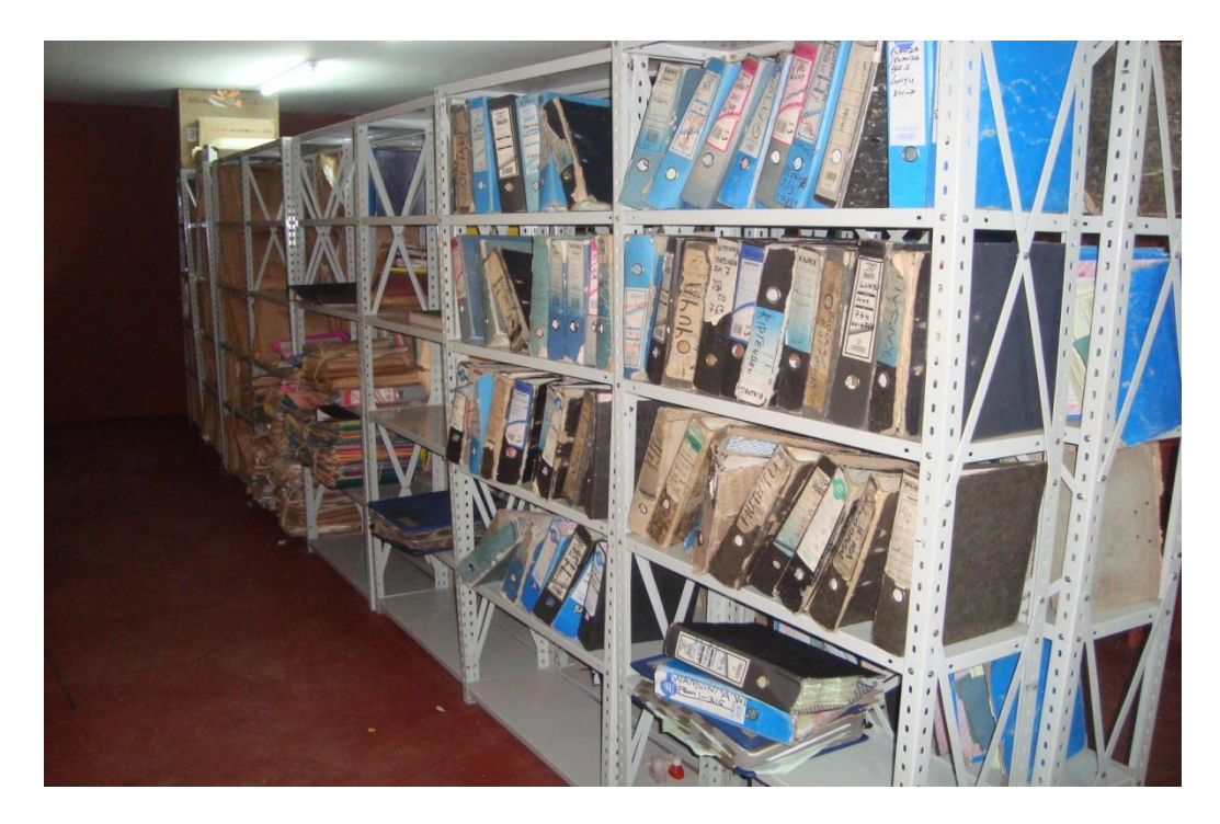
Land Registers and files