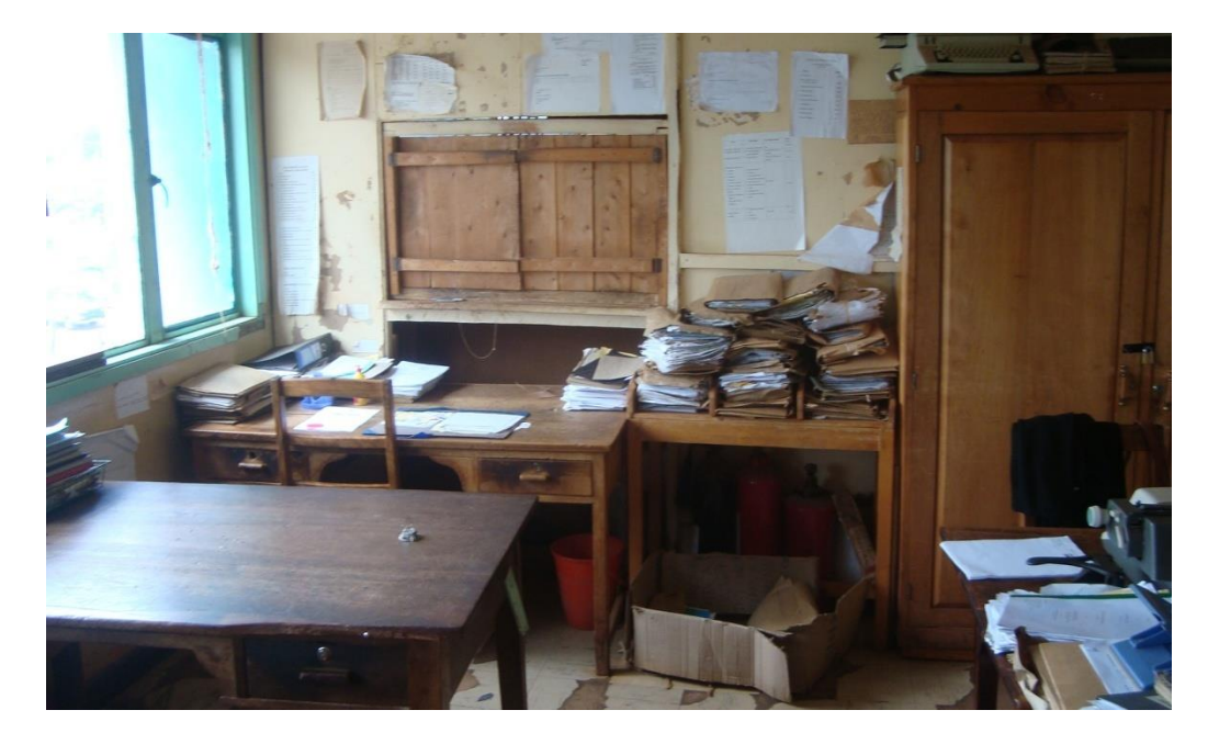
Documents stored in the crammed Registry